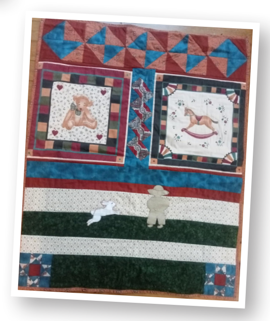
New members always welcome